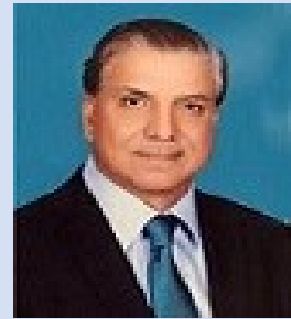
Lt. General (Retd) Muzammil Hussain

It gives me immense pleasure to write a few words for Newsletter on Dasu Hydropower Project. It is currently the largest hydropower project under implementation not in Pakistan but in the whole of South Asia. I feel proud that work on Dasu HPP is gaining momentum with the passage of time. The perseverance and dedication of all employees and workers of WAPDA, consultants and contractors are indeed worth appreciating. I strongly believe that Dasu HPP will play a pivotal role in the development and prosperity of the country. I pray to Almighty Allah for blessing us with the commitment and courage to complete this project successfully.