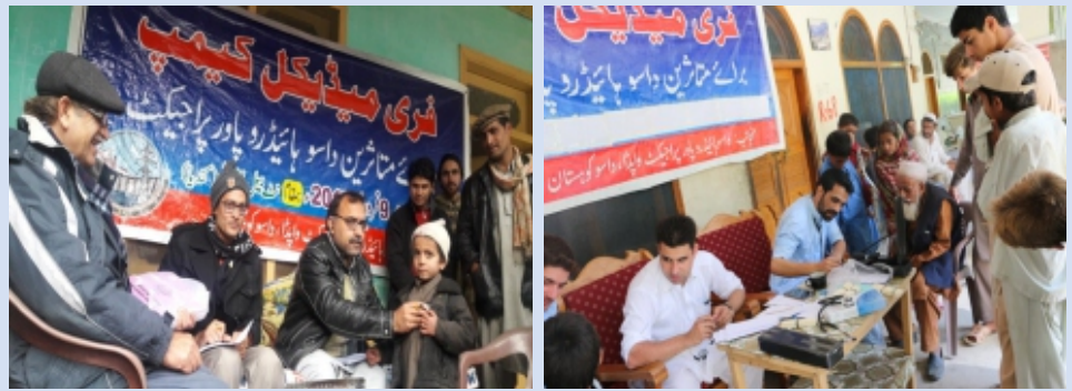
Free Medical Camps For Affectees of DHPP

Keeping in view the available health facilities in the project area. Gender & Community Health Section Dasu HPP organized 1st free medical camps in Kandia, Shatyal, Doga, Barseen, Summer Nala and Khoshi from February 6-9, 2017 and 2nd free Medical Camp for affectees of Dasu HPP at Sigloo area on 16 July 2017, 2501 and 201 people were treated respectively in both camps. Majority of patients were children and women.