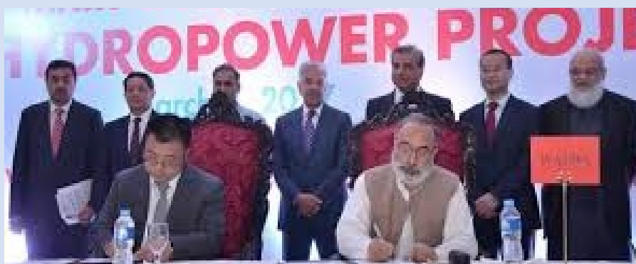
Main Works Contract Signing Ceremony

Water and Power Development Authority (WAPDA) on March 09, 2017 signed two contracts, MW-01 worth Rs115 billion and MW-02 worth Rs64.4 billion with M/s. China Gezhouba Group Company (CGGC) for execution of main civil works of the Dasu hydropower project.