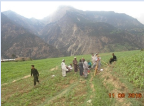
Resettlement & Rehabilitation team working in the field for selection of resettlement sites in coordination with local community / affectees.