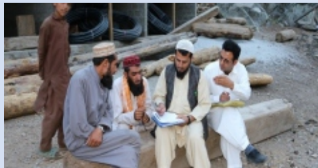
CNA Survey at Looter Village