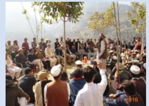
Dasu HPP management in presence of World Bank representatives & consultants discussing issues with reservoir community.