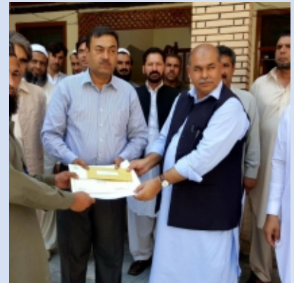
Chief Engineer (SR&E) distributing Certificates