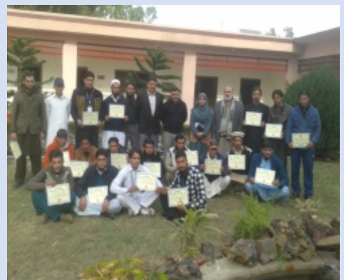
Group photo of trainees with the GM/ PD Dasu HPP.at ATIN, NLC, Mandara, Rawalpindi.