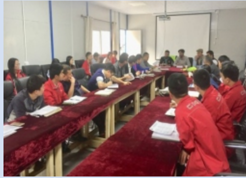
Migration Management team during meeting with main contractor ( MW1 & MW2) , regarding labor issues

Establishment of Vocational Training Schools both for males and females at Dasu HPP are proposed to be constructed in the long term program of Livelihood. Therefore, as immediate step, vocational training of male affectees of Dasu HPP, WAPDA has arranged 6 months Vocational Training Program from July, 2017 to December, 2017 for Project Affectees to enhance their skills for the betterment of their livelihoods. Total 20 participants have completed their training in different trades from ATIN, NLC Mandra, District Rawalpindi. Four (04) batches of Dasu affectees have already completed their training in different trades from ATIN NLC. Dina since December 2013.