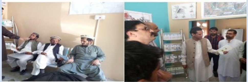
Public Information Centre (PIC) established for information sharing with the affected community & general public regarding Dasu Hydropower Project.