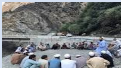
Jirga - Culture of Kohistan