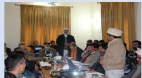
WB - Progress Review Meeting

World Bank delegation visited Dasu HPP to review the progress and share their input to improve effectiveness and efficiency in the project deliverables. The visit was for a period of two days from January 8, 2017 to January 9, 2017. The delegation consist of experts who had meetings with all the sections of the project.