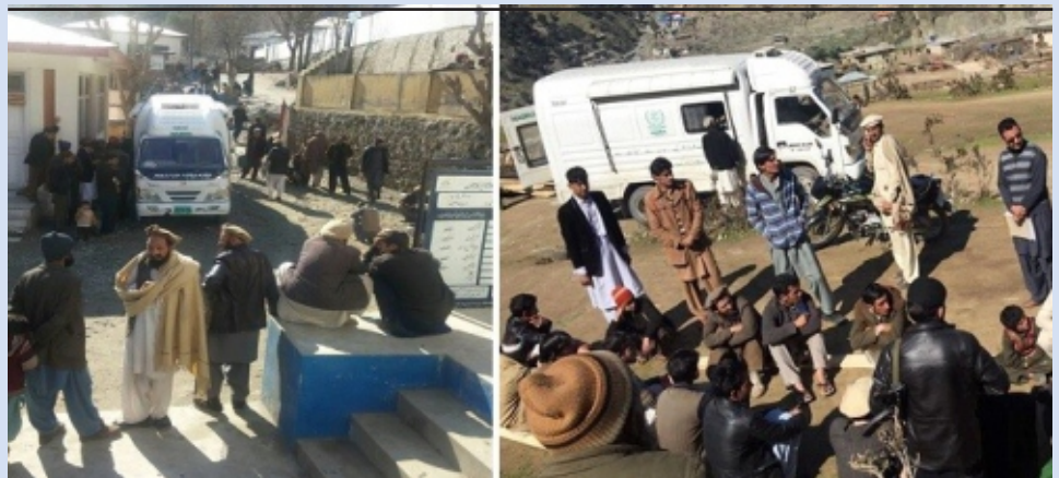
NADRA MRV-People gathered for NIC Registration

In the wake of the fact that majority of the PAPs, especially, the women did not possess National Identity Cards which was a kind of hindrance in smooth compensation payment, Communication team of Dasu HPP in collaboration with DHC and District Administration had initiated the process for provision of NADRA MRV for the registration of PAPs with NADRA in all the 34 villages of project area. Almost all villages were covered during this campaign thereby registered total number of beneficiaries 598. Out of the total, 80% were women.