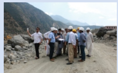
Work in Progress on KKH-01