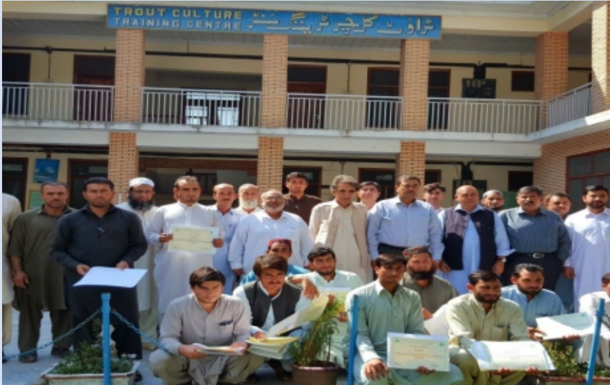
Group photo of participants of fisheries training with Chief Engineer (SR&E)

Dasu HPP, WAPDA has arranged one week training for Dasu affectees in the field of "Fish Farming/Fish Hatchery Management" from 21 st – 27 th September 2017 at Trout Culture and Training Center, Swat. The training was organized to improve the existing socio-economic condition and capacity building of Dasu affectees. Total 14 participants from project area have participated in this training.