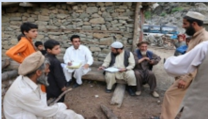
CNA Survey at Uchar Village

A survey regarding Communication Need Assessment (CNA) was conducted in all the affected villages of Dasu Hydropower Project. Communication team, in collaboration with DHC, conducted the survey to identify all the possible and most feasible modes of information dissemination in the Project area. Total 169 samples were collected and analysed for further implementation.