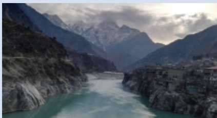
Indus River View

Dasu Hydropower Project with a capacity of 4320 MW is being constructed about 7 KM upstream from Dasu, the capital of Kohistan. Indus River has a unique and feasible nature for construction of dams. In this background, a series of dams are being or proposed to be constructed over River Indus like Bonji, Diamer Bhasha, Dasu Dam, Pattan Dam, Thakot Dam and Tarbela Dam etc.