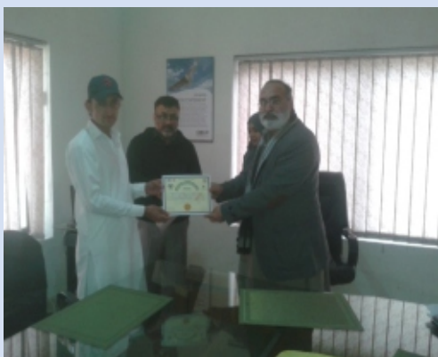
GM/PD Dasu HPP is distributing certificates among the successful candidates of vocational training conducted in ATIN, NLC Mandra,Rawalpindi.