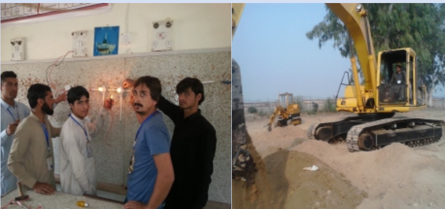
Vocational Training Program for Dasu HPP Affectees-Participants getting training in different trades at ATIN, NLC Mandra.

Dasu HPP, WAPDA has arranged 6 months Vocational Training Program from July, 2017 to December, 2017 for Project Affectees to enhance their skills for the betterment of their livelihoods. Total 20 participants are getting training in different trades from ATIN, NLC Mandra District Rawalpindi.