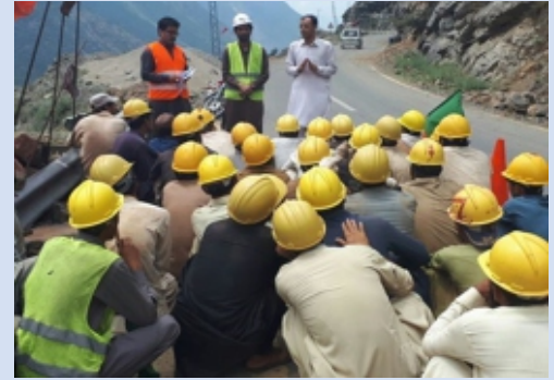
Awareness session with the labors working on Transmission Line.