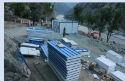
CGGC Camp Barseen