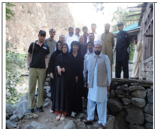
Photo1: Visit to Community on Left Bank