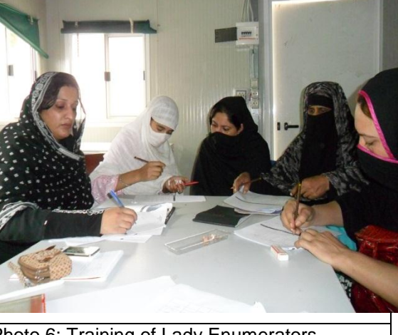
Photo 6: Training of Lady Enumerators (LHVs) by Gender Resource Person